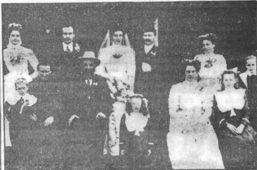
CERTIFICATES lodged by wedding groups can provide details of family history.

The name and baptismal name, if different; sex; year, date of month and hour of birth; place of birth (if in lodgings, so stated); father's name, rank, profession or occupation, his