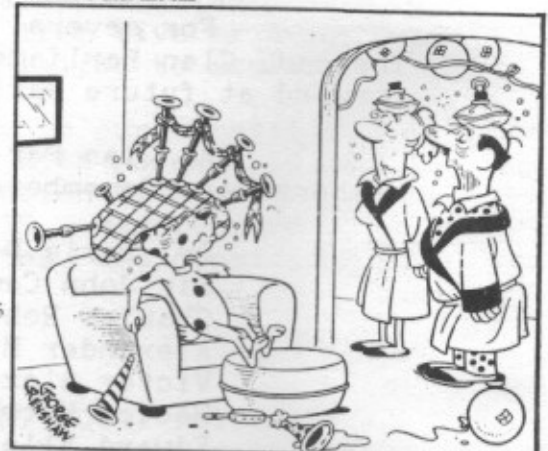
"ALL I KNOW IS HE HAD A HEAVY DATE WITH A SCOTTIE LAST NIGHT."