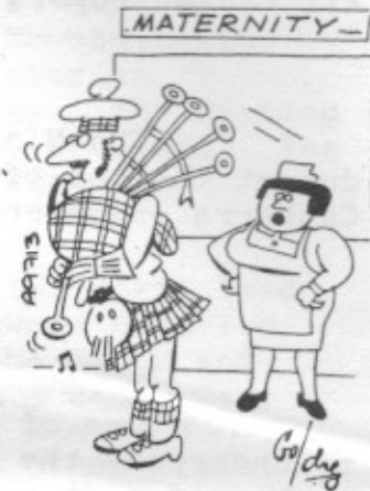
"Would you mind not playing that thing in here! — I keep thinking it's one of the babies crying!"