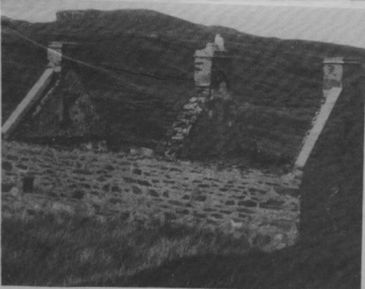
NOT A COLONSAY 93 COTTAGE!