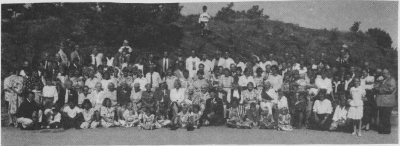
Above Members of the Thorburn-Macfie Family Society gather for a group photograph following their Triennial General Meeting in Uddevalla, Sweden, on Saturday, 4th July, 1992.