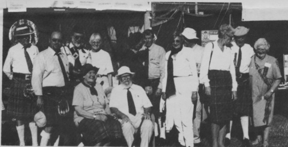
Clan Society members enjoying the day at Bundanoon April 1999

27 & 28 May 2000 Macfie Clan Society BGM Adelaide