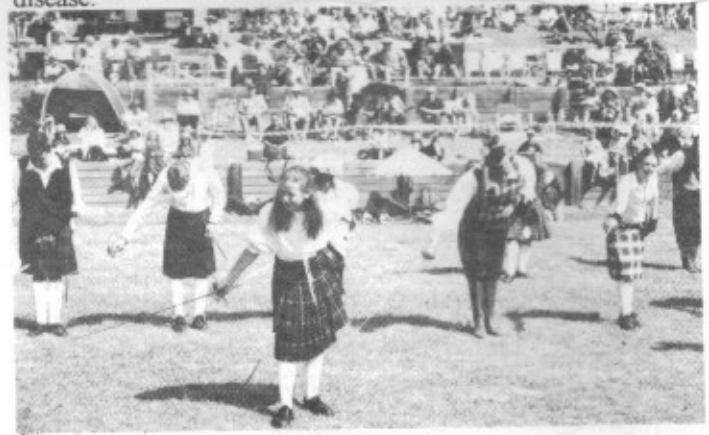
Faces of Bundanoon 2001

People always want to know if their ancestors have been involved in great events such as battles and natural disasters, but this is actually hard information to find. Despite Scotland's long history of fighting, and a countryside littered with battlefields, few records of wars are ever detailed. Usually, only the losers get a mention - such as the prisoners of the 1745 Battle of Culloden for instance. Other great upheavals leave even fainter traces - with the exception, it seems, of outbreaks of disease.