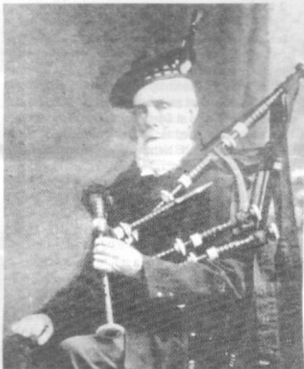
A great photograph of an old Scot.

In 1616 the newly formed Church of Scotland issued an edict that every member church should keep a record of Baptisms, Marriages, and Deaths, but only a few parishes took any action in this regard. In fact only 21 parishes kept registers before 1700 and 35 did not start registers until 1801. Very few of the registers of Scotland have been printed and published or even transcribed into manuscript.