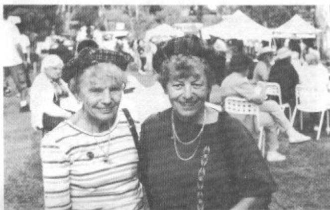
Faces of Bundanoon 2001

In those early days funeral processions sailed along the Hawkesbury with the leading boat manned by rowers using muffled oars, towing the boat containing the coffin and the mourning craft following.