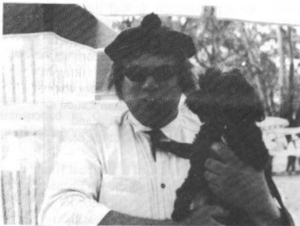
Faces of Bundanoon 2001