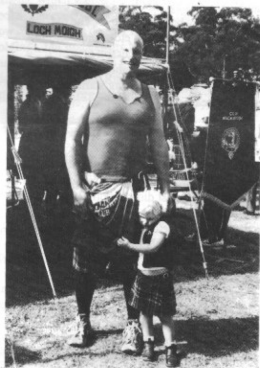
Faces of Bundanoon 2001