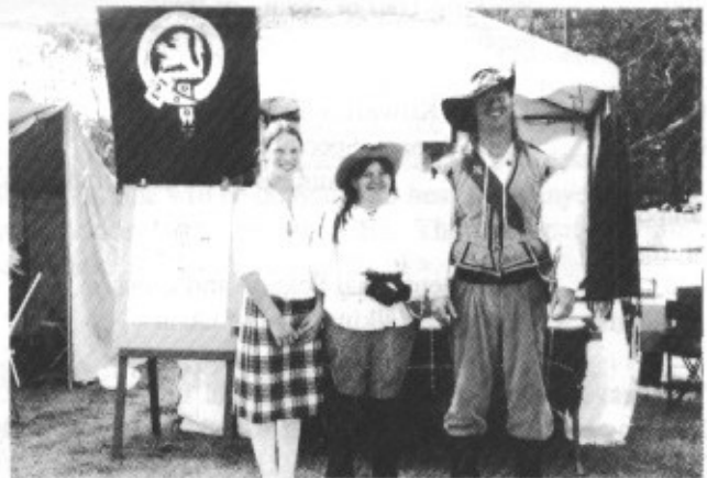
Faces of Bundanoon 2001