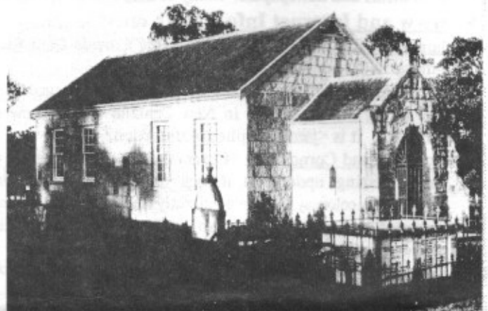
EBENEZER CHURCH — 1809 "Hitherto hath the Lord helped us"