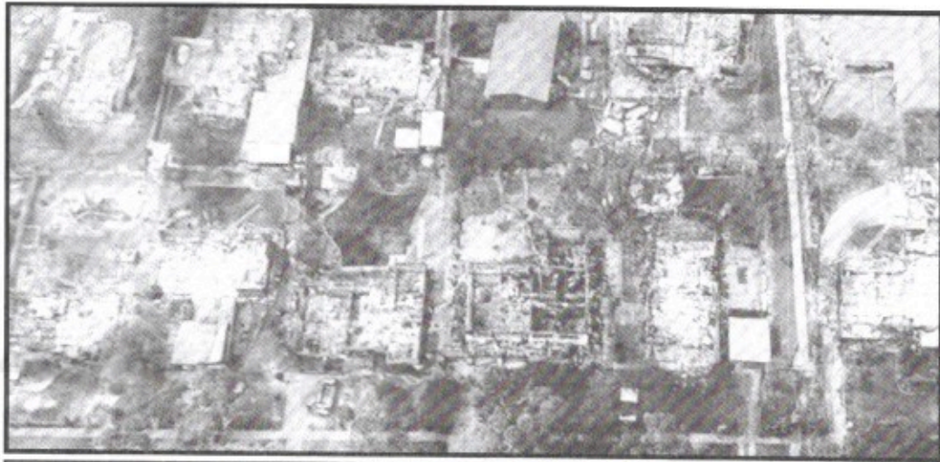
Houses in Canberra suburb, Duffy, destroyed by fire